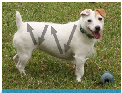
ZigZag touch technique.

Finally, place your hand gently on your dog's shoulder and with soft flexible fingertips, move your hand in a zigzag pattern down his torso to his hips. You may notice him taking a deeper breath, or doing a bit of a"shake off" (as if shaking off water) as he settles a little more fully into his body.