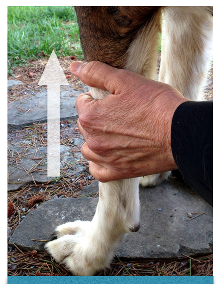
Lift technique.

rhythm, move to a part of his body that he may find a little more challenging, such as the hind end and then immediately return to a place that he loves. Lift your hand from his body after every few touches to give your dog the choice to continue or to stop. If he decides to move away, that's fine. A single touch has an effect, and if he learns that he has a choice, his trust in you will deepen.